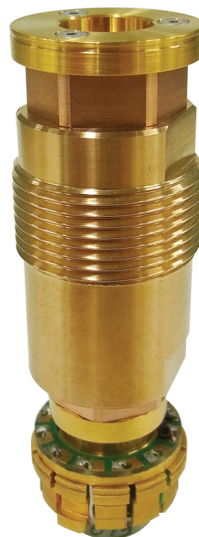
High Pressure Cell for Electric Transport Measurements

Specifications are subject to change without notice.